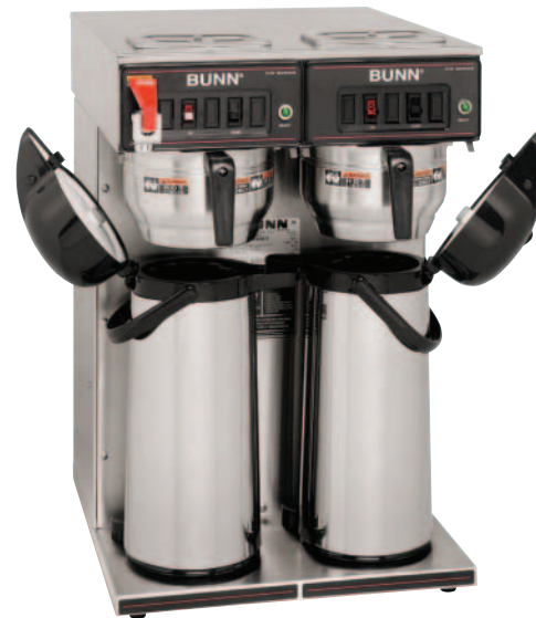
Model CWTF Twin APS with Airpots